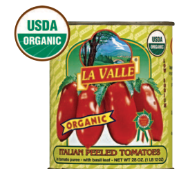
La Valle Organic Italian Whole Peeled Tomatoes 28 oz. Save $1.00