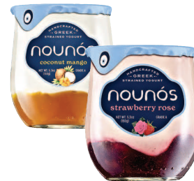
Nounos Greek Lowfat Yogurt 5.3 oz. Save $1.58