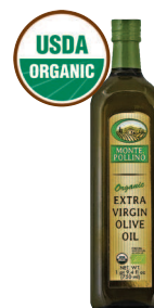
Monte Pollino Organic Extra Virgin Olive Oil 750 ml. Save $4.00