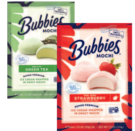
Bubbies Mochi Selected Varieties, 6 count Save $0.50