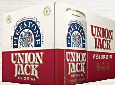
Firestone Walker Union Jack West Coast IPA 6-Pack Cans